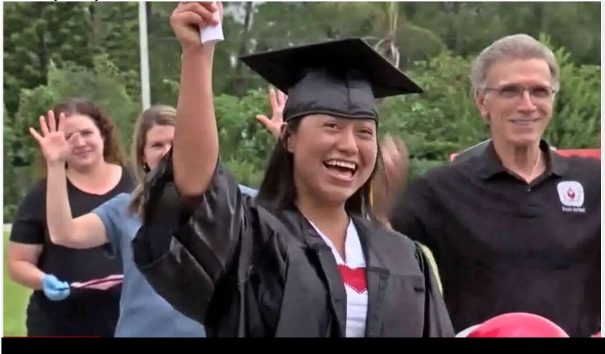
Graduation caravan held for Palm Beach County youth in foster care (WPEC)

WEST PALM BEACH, Fla. (CBS12) — Less than half of foster kids graduate high school and when they do, most of time there is no family there to cheer for them as they walk across the stage.